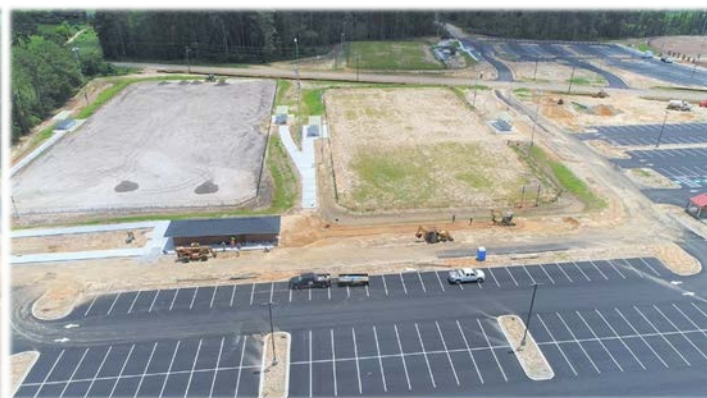
2- Football Fields with Concession Stand and parking areas. Practice field & additional parking is in background of photo.