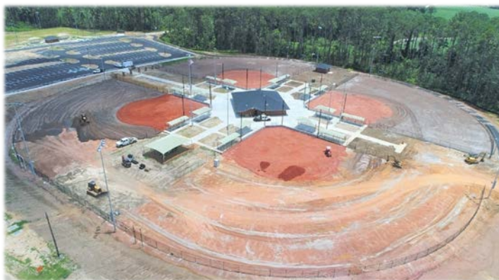
4- Baseball/Softball Fields with Concession Stand & Playground and parking area

PREMIER SPORTS PARK – Continued construction with infields receiving clay fencing, and parking lots are paved.