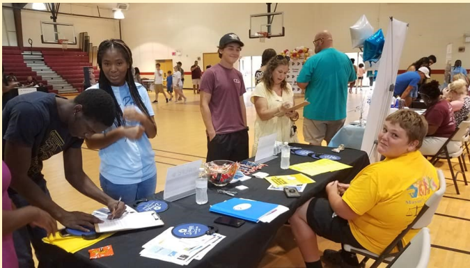
Youth Council booth at George Washington Carver Freshman Campus orientation in August.