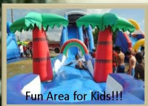
Fun Area for Kids!!!

For more information contact the City of Douglas (912) 383-0277 or Email: info@cityofdouglas.com WEBSITE: www.cityofdouglas.com/OutdoorExpo