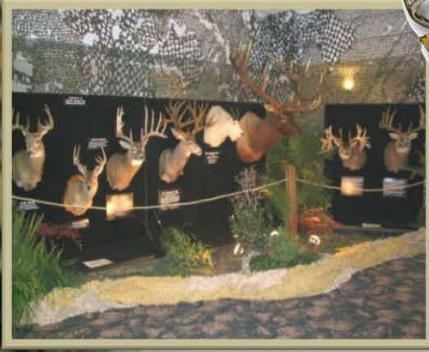
World Record Exhibit