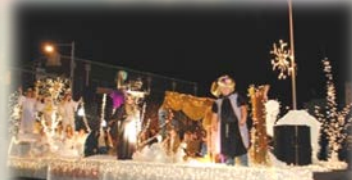
Westwood Baptist Church