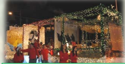
Saving Grace Ministries & Trinity Church