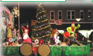
Wiregrass Georgia Technical