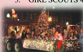
Girl Scouts 40607