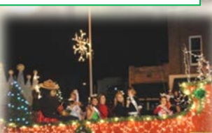
Coffee Forestry Queens