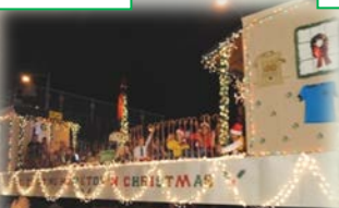
Girl Scout 40575 & Pack 221