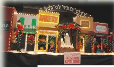
College Avenue Baptist