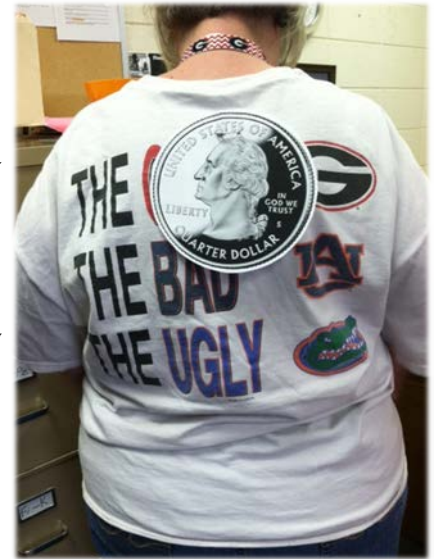
They all work at the City of Douglas, of course!

What do a Monk, a Georgia Quarter Back, Pink Lady and Candy Corn all have in common?