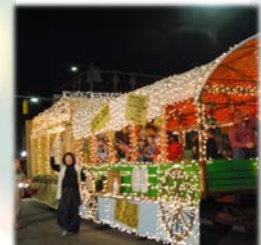
Trinity Church & Saving Grace