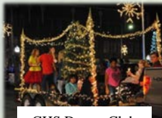
CHS Drama Club