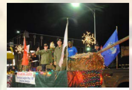
American Legion Post 18, Post 515, and 848 TH Eng Co.