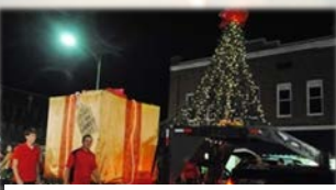
First Assembly of God