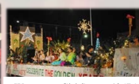
Westgreen Girl Scouts 40575