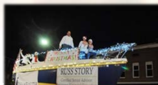
Story Wealth Management