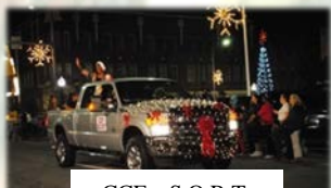
CCF - S.O.R.T.