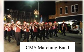
CMS Marching Band