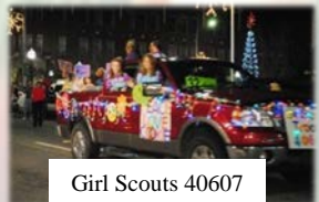
Girl Scouts 40607