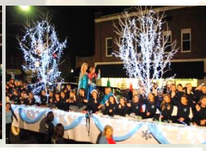
On Your Toes Dance Studio