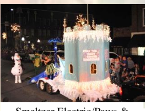
Smeltzer Electric/Paws & Claws