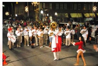
Danny’s All Star Marching Band