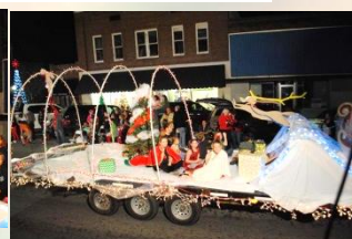
Cargo Craft, Inc.