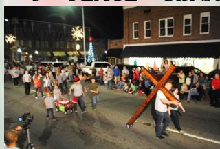
Douglas Christian Fellowship