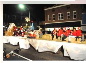
Your Fight is Our Fight Cancer Group