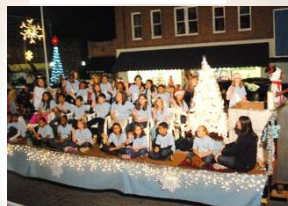
Satilla Elementary Show Choir