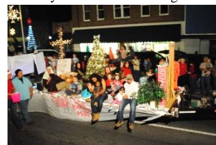
Southview Church of God