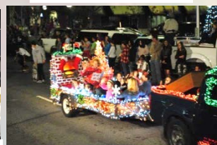
Girl Scout Troop 40613