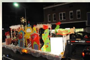
First Assembly of God