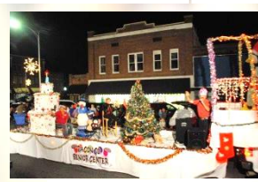
Alma Sr. Center