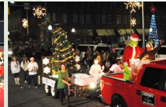
CHS Drama Club