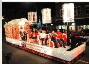
McRae Coca Cola