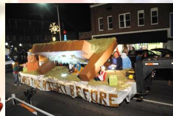
St. Illa Missionary Baptist Church