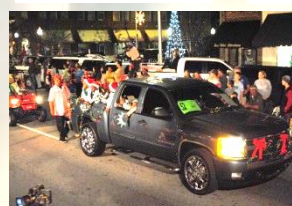
Eastside Eagles Cheer