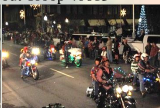
Heaven Bound Ministries