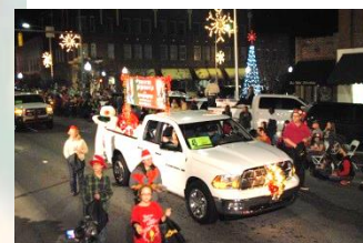
West Ward Church of God