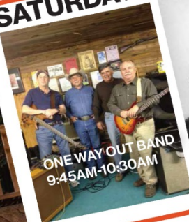
ONE WAY OUT BAND 9:45AM-10:30AM