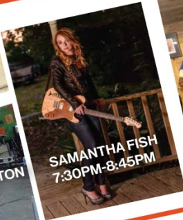
SAMANTHA FISH 7:30PM-8:45PM