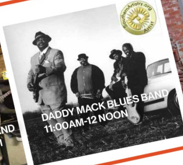
DADDY MACK BLUES BAND 11:00AM-12 NOON