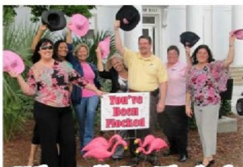
Who will Get Flocked?

Promoting a Healthy & Productive Workplace Networking Reception - Dinner - Keynote Speaker - Awards