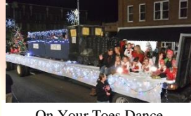
On Your Toes Dance Studio