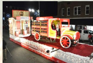
McRae Coca Cola