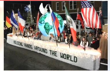
2 nd Ward – Church of Jesus Christ of Latter Day Saints

1 ST PLACE – Girls Scouts Service Area 40409 2 ND PLACE – Cub Scout Pack 859 3 RD PLACE – Heaven’s Saints Motorcycle Ministry