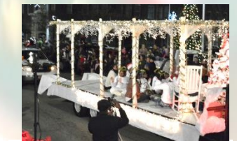
Hightower Memorial Temple