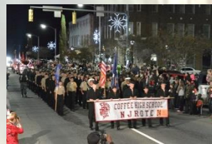
CHS Navy JROTC