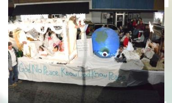
Southview Church of God