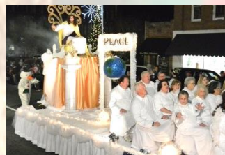
West Ward St. Church of God