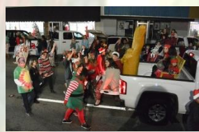
CMS Art Club