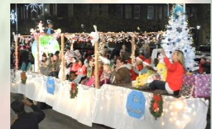
Girl Scouts Service Area 40409