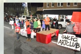
GWC Freshman Campus Art Club