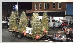
Georgia Forestry Comm.