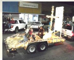
Heaven's Saints Motorcycle Ministry