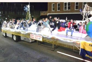
Cub Scout Pack 859