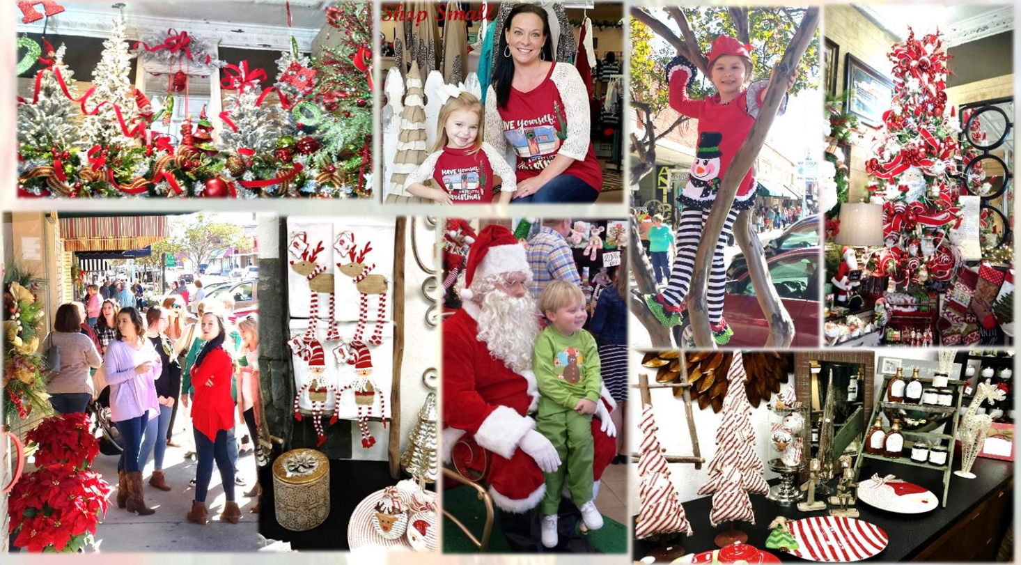
Scenes from Small Business Saturday!

Thanks for making Holiday Open House a success for our local Main Street and downtown merchants! Remember to shop Main Street for all your Christmas surprises!!