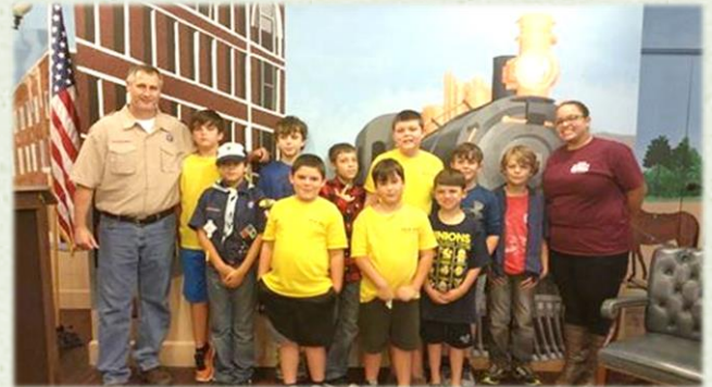
Great group of Boy Scouts visited the Museum in December! Thanks for visiting and learning about local history with us.