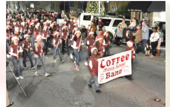
CMS Marching Band

Special Thanks to our Parade participants and judges! Great job!