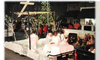
New Hope Covenant Fellowship