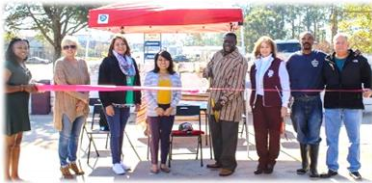
Divine Shine Car Wash, located at 519 N. Peterson Ave.