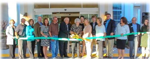
Shady Acres Open House & Ribbon Cutting