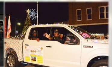
American Legion Post 515