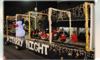
Empowerment Center International Ministries