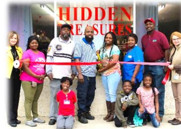
Ribbon cutting for Hidden Treasures, located at 607 West Baker Hwy in Douglas.