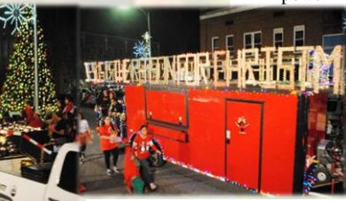
Cynergy Cargo, LLC