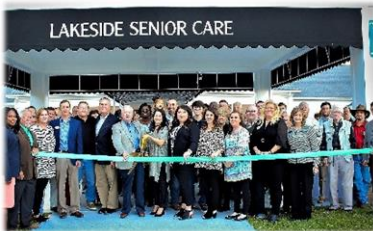
Lakeside Senior Care located at 1025 N. Chester Avenue.