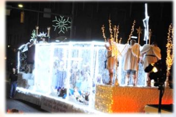
Westwood Baptist Church