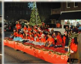
Satilla School Show Choir