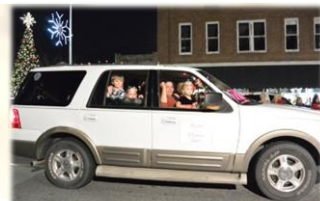
Angels for Orphans