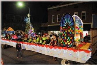
On Your Toes Dance Studio