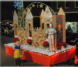
Parker’s Pet Palace