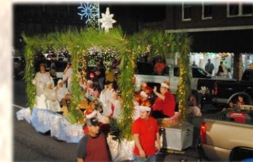
Harvest Time Church of God