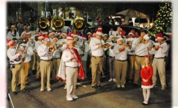
Danny’s Pizza Allstar Marching Band