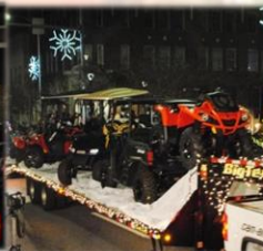
Mike’s Golf Carts & Powersports