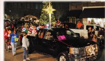
Boys & Girls Club