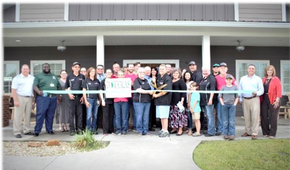
Hog-N-Bones, located at 24 Ameris Drive. 912-720-2233