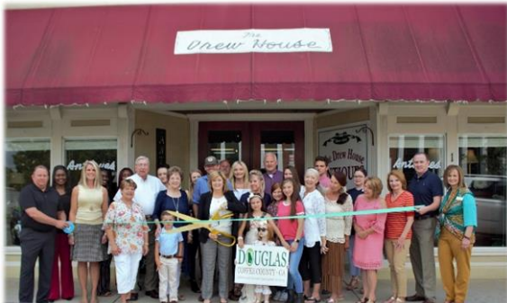
The Drew House, located at 108 N. Peterson Avenue. 912-384-0838

Thanks for doing business in the City of Douglas and Coffee County!