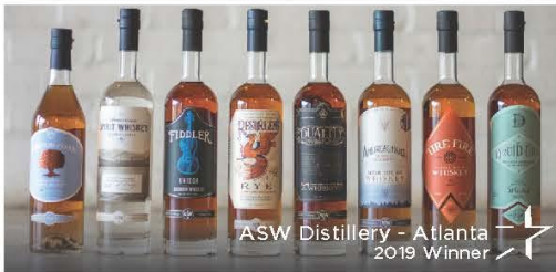
ASW Distillery - Atlanta 2019 Winner

Nominations are now open for the 2020 ROCK STARS!