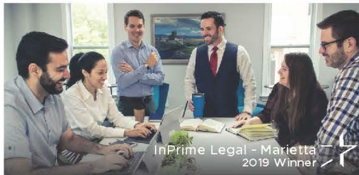
InPrime Legal - Marietta 2019 Winner