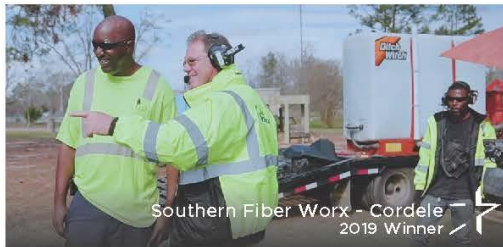
Southern Fiber Worx - Cordell 2019 Winner