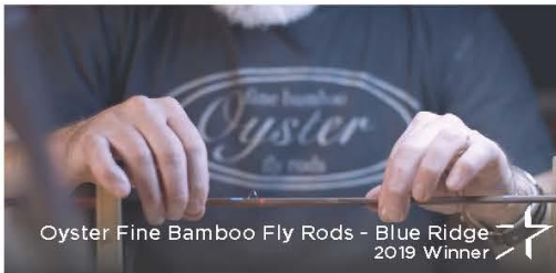
Oyster Fine Bamboo Fly Rods - Blue Ridge 2019 Winner