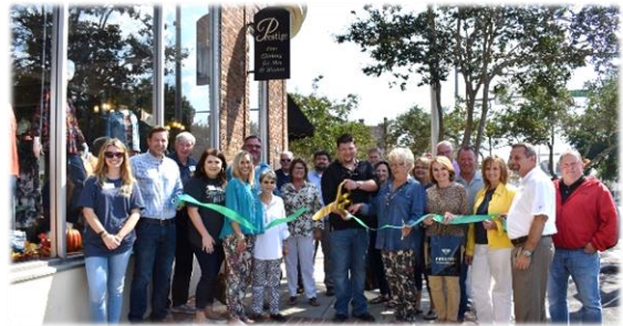
Prestige: Fine Clothing for Men and Women located at 102 North Peterson Avenue