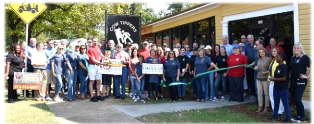
Cow Tippers Burger Company located at 216 North Madison Avenue