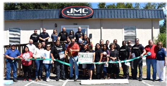
JMC Auto Sales located at 786 Thompson Drive