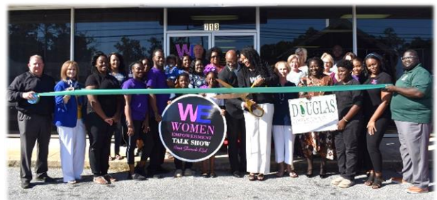
Women's Empowerment located at 713 W. Ward Street.