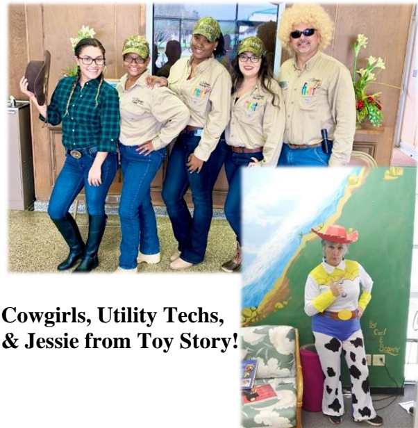
Cowgirls, Utility Techs, & Jessie from Toy Story!