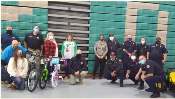
Community Toy Drive Committee Members