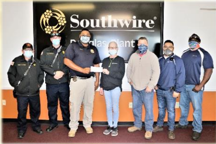
Special thanks to Southwire for their continued support each year.

THANK YOU, to EVERYONE who helped make CHRISTMAS BRIGHTER for children in our COMMUNITY! Special thanks to CSRA Probation Services, Southwire, Douglas Police Department, Douglas Fire Department, City of Douglas, Douglas Lions Club, Walmart Store, Walmart Distribution Center, and citizens for their support and contribution to this community event.