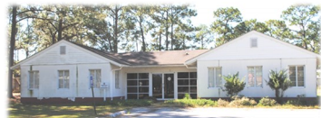
2. Barracks 5—Used for housing for cadets. Future Usage: Professional Services and Aviation.